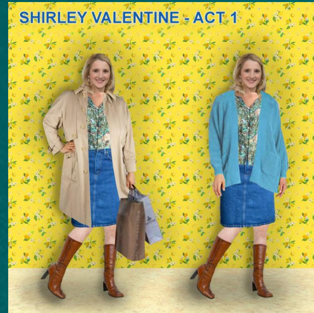
- Costume Designs

“When originally designing Shirley Valentine I wanted her kitchen and Greece to feel like completely opposite spaces. I was keen to have a huge, calming expanse of blue sky in Greece which lead to the kitchen feeling small, busy and overwhelming. Shirley mentions in the play that she had previously painted the kitchen yellow so I really ran with that theme and chose a strong yellow for the walls and cupboards. Her costumes also mirrored the yellow and blue spaces, she wears mostly blue in the kitchen and mostly yellow in Greece.”