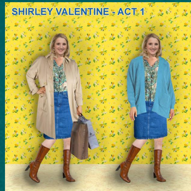
- Cynlluniau Gwisg

“Pan ddechreuais i gynllunio Shirley Valentine o’n i eisiau i’r gegin a Gwlad Groeg i deimlo fel gofodau hollol wahanol. Roeddwn i’n awyddus i weld yr awyr mawr glas yn Gwlad Groeg a byddai wedyn yn gwneud i’r gegin i deimlo’n fach, prysur ac yn llethol. Mae Shirley yn sôn yn y ddrama am beintio’r gegin yn felyn felly fe es i amdani gyda melyn cryf am y waliau a’r cypyrddau. Mae’r gwisgoedd eto yn dilyn yr un thema o liwiau glas a melyn – mae’n gwisgo lot o las yn y gegin a melyn yn Gwlad Groeg.”