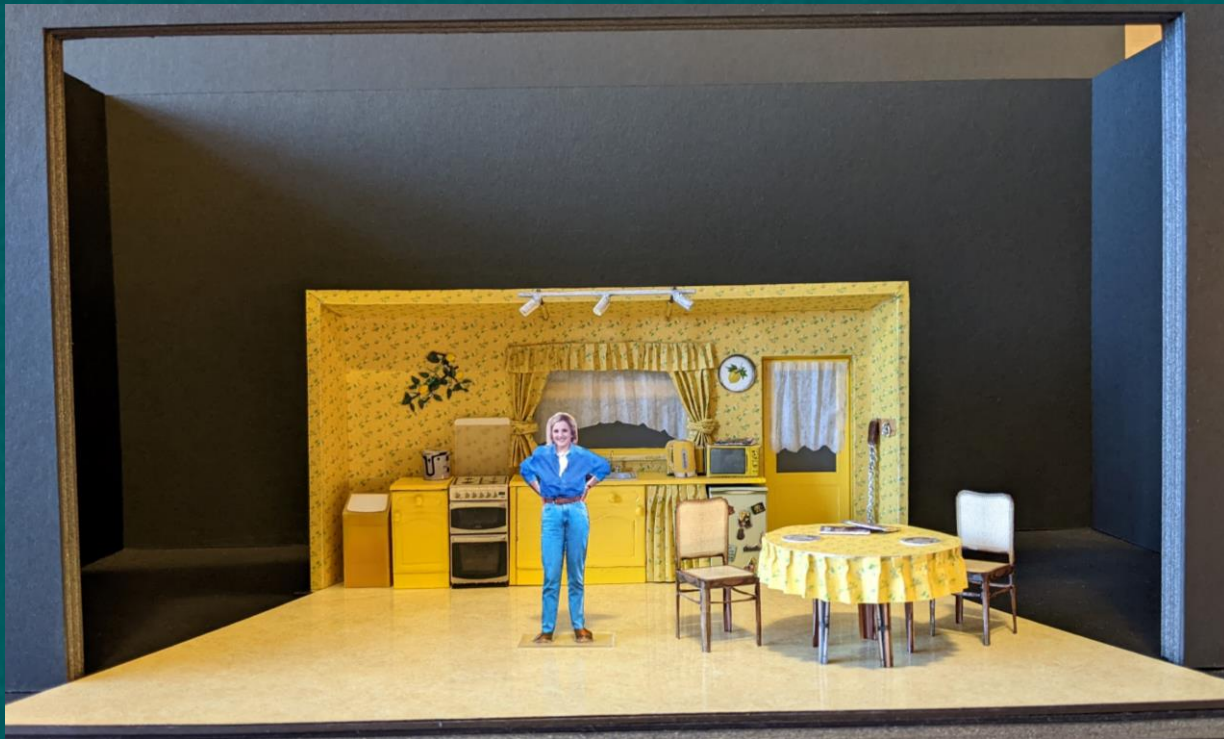
- Cegin Shirley