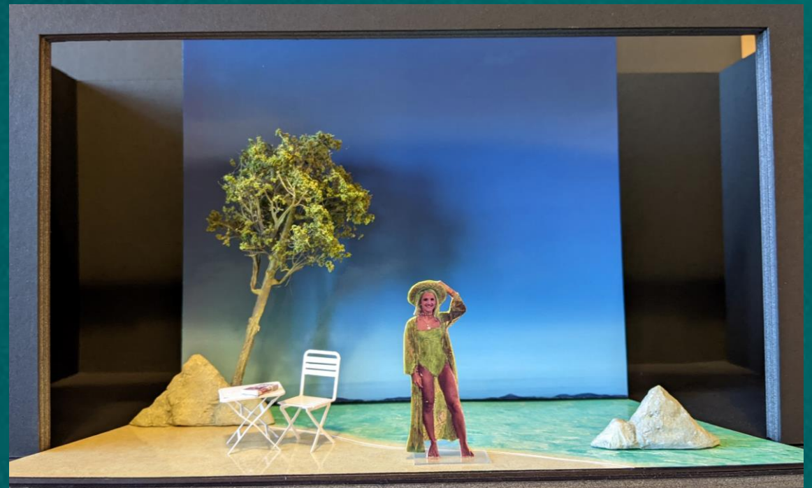
- Gwlad Groeg